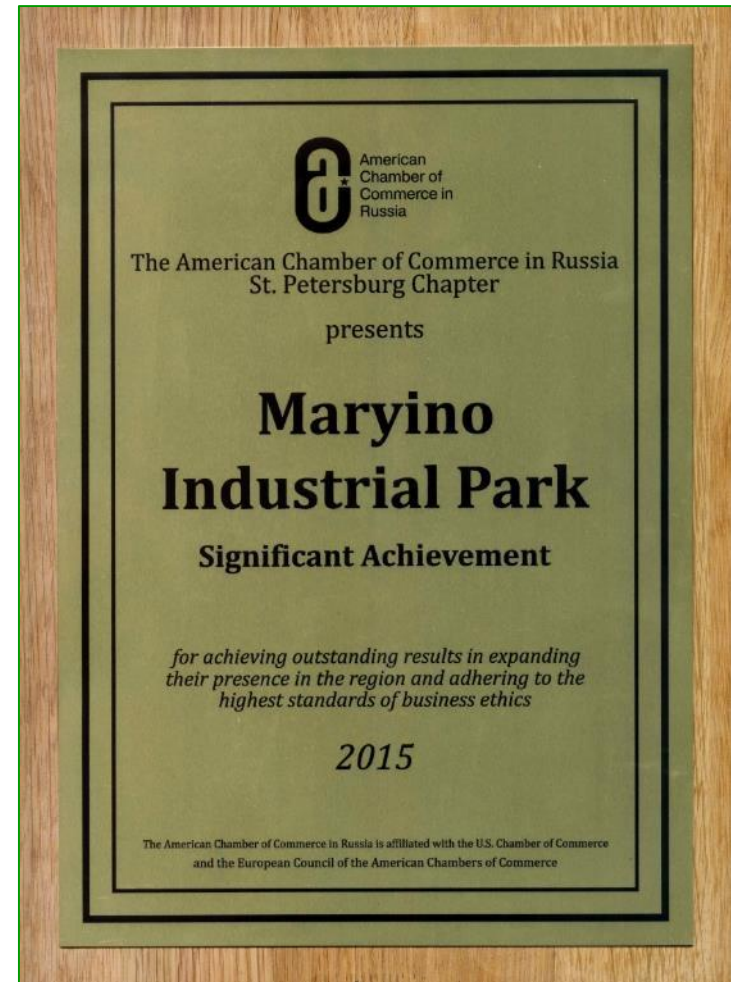
AmCham Russia award

Best industrial park of the Russian Federation