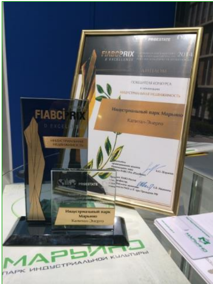
FIABCI Prix d'Excellence 2014

Best industrial park of the Russian Federation